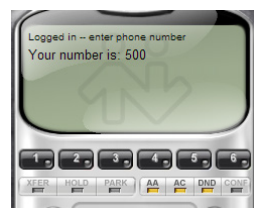
Figure 1-3 < Finish >